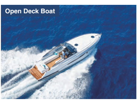
The waterproof CommandMic<sup>™</sup> can be used in open top areas even in rain or splash conditions.