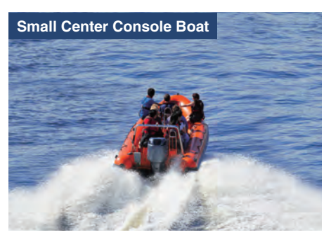
Stow the RF unit out of site and have only the CommandMic ^{\text{TM}} on the console panel.