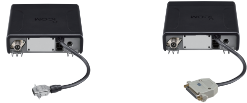
Optional OPC-1939 installation image Optional OPC-2078 installation image