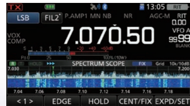
Display example of real-time spectrum scope and waterfall

Performance seen with the IC-7300 and IC-9700 spectrum scope is at the tip of your fingers for field operation. You can quickly see band activity as well as finding a clear frequency, all in the compact radio and not as an expensive add-on.