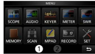
Menu screen example