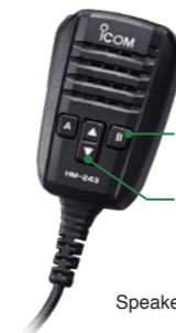
Programmable buttons Up/Down buttons Speaker microphone <HM-243>

Enjoy portable operations with the supplied HM-243, programmable speaker microphone. Perfect for operation with the IC-705 safely secured in the optional LC-192 backpack. User assignable buttons put functions like frequency and volume adjustments at the tip of your fingers, without removing your backpack.