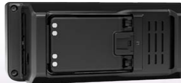
BP-272 attached (Rear panel view)

Utilizing the high capacity Li-ion battery from the ID-51E and ID-31E handheld radios. A 13.8 V DC external power supply can be used for operation and charging of the BP-272.