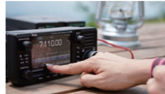
Touch screen display

The large 4.3" colour TFT touch LCD, same size as the IC-7300 and IC-9700, offers intuitive operation of functions, settings, and various operational visual aids, such as the band scope, waterfall, and audio scope functions.