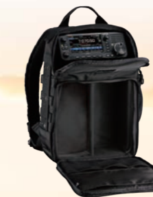
LC-192 Multi-function backpack

Designed to be the "Ultimate", must have accessory for the IC-705, the LC-192 is the perfect utility backpack. Features like a safety strap, with a 1/4"-20 mounting lug to keep the IC-705 from accidentally falling out of the custom radio compartment, to the user adjustable internal panels for custom compartments for antennas, battery packs, or other items necessary for an afternoon SOTA activation.