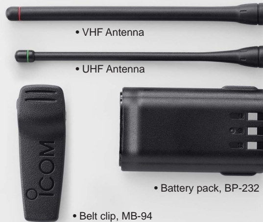
• VHF Antenna